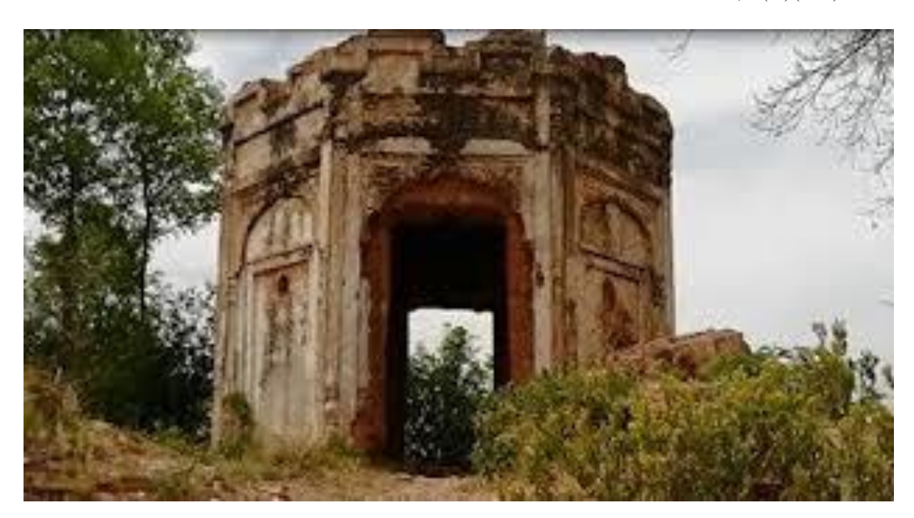
Fig.4. The main complex of Baradari