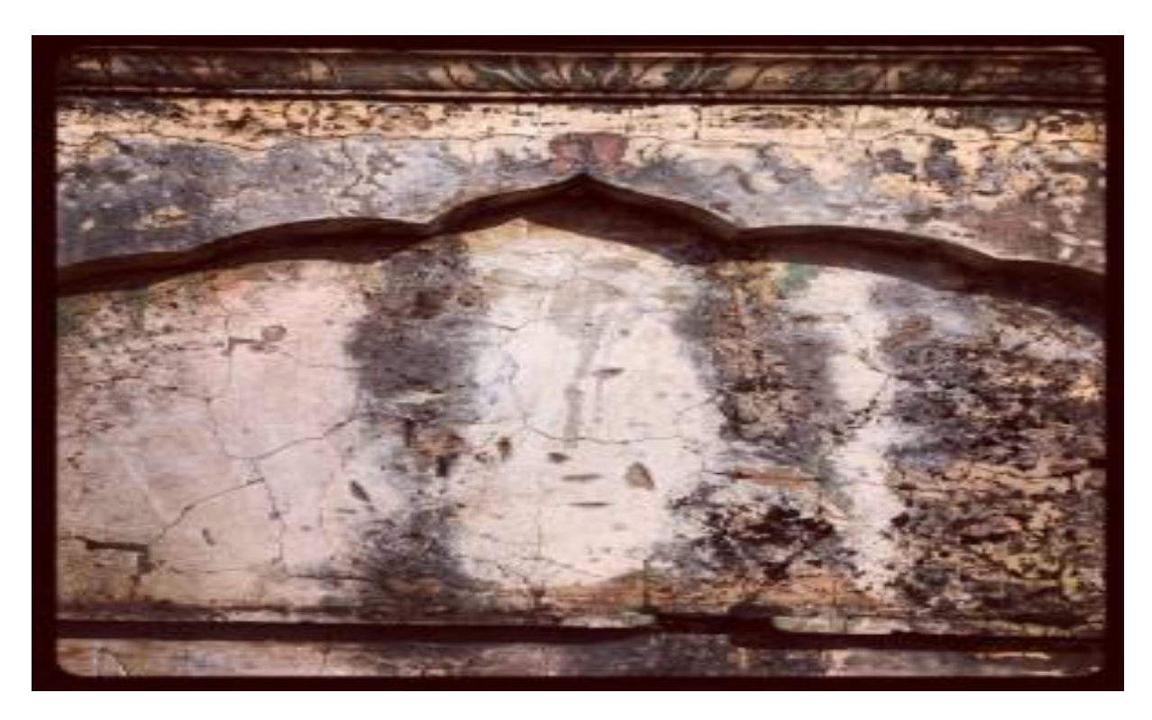
Fig.2. A blind arch having some traces of paintings