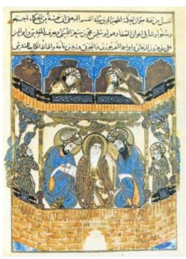
The letters of the Ikhwan al-Safa and Khallan Alofa 1287 CE in Istanbul

With a sense and internal feelings synchronized with thinking to understand the meaning.