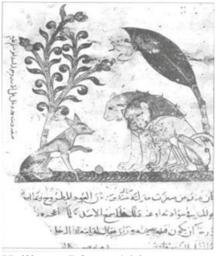
Kalila wa Dimna 14th century

And psychological satisfaction because it is full of suggestion. Photography is an art industry with which we express the inadequacies of the human soul in all its scattered visions, thoughts and feelings, and it does not differ in anything from the impactful goal that every beautiful art that is characterized by expression seeks. There are intuitive perceptions