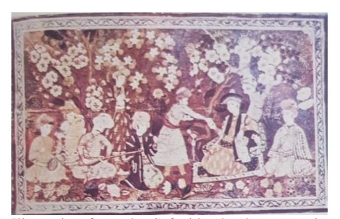
Illustration from the Safavid school representing a feast in a garden (11th / 17th century)

Souls of rapture strengthen the psychological strength. Meditation of combat, war and hunting strengthens animal forces. Watching natural images of orchards, trees and flowers strengthens the natural forces, and these were helping the bather to strengthen the forces within him and replace what he lost. (Mohammed, 1987 p.: 219(