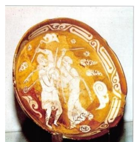
Porcelain dish with metallic luster with an engraved drawing representing two men jousting with tahtib sticks, BC 11

According to the visions, each of them had strong ties to the movement of life and society in the Islamic world. Therefore, it is possible to count the aesthetic pleasure closely related to photography, given that the various and different points of view have demonstrated artistic beauty among Muslims due to the difference in mental and imaginative faculties (Abd al-Raouf, 1981 p.: 12). The aesthetic vision in photography for Muslims is based in one way or another on the references of the Noble Qur'an and the honorable Sunnah of the Prophet, not to mention the proposals of thinkers who had a special view of art and its aesthetics and were greatly influenced by the countries that opened to Muslims and the nature of social and cultural life.