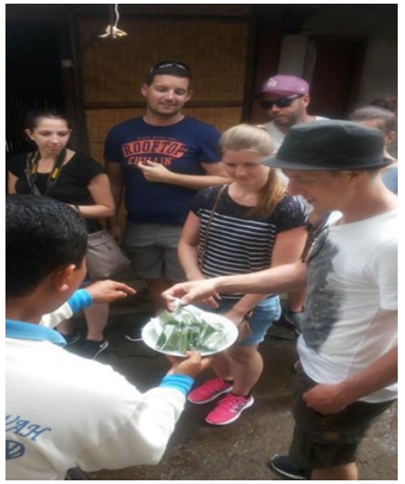
Picture 7: Pinge Tourism Village Cooking Class Activities

In addition, the artificial potential in Pinge Tourism Village is cooking classes and coffee breaks. Cooking class and coffee break activities can be carried out by tourists at each homestay and managed by the homestay manager and the time for cooking class and coffee break activities is usually at night because most tourists stay only overnight, but it is possible to do it in the morning or afternoon. The menus that are commonly used as cooking class activities are also determined by the homestay manager. The price offered to carry out cooking class activities is included in the homestay rental price.