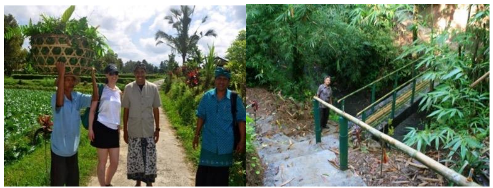
Gambar 2: Trekking Activities at Pinge Tourism Village

the village community's cooperation is the opening of a village route to Beji Temple for about 1 km with a road width of 1.5 m which will be used as a tracking and religious route. In addition, for the future plans, the village community will arrange the place around Beji Temple as a place for meditation and yoga.