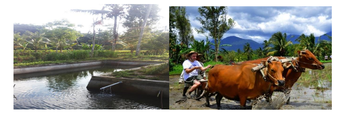
Picture 1: Fishing Ponds and Plowing Activities in the Subak Pacung area

One of the natural potentials of the Pinge Tourism Village besides its beautiful rural natural scenery, is Subak Pacung. Some activities that can be done around Subak Pacung rice fields are fishing in the available fishing ponds, plowing the fields, and walking around the rice fields by seeing the beautiful scenery. The right time to enjoy the natural beauty around Subak Pacung is from 7 am to 10 am.