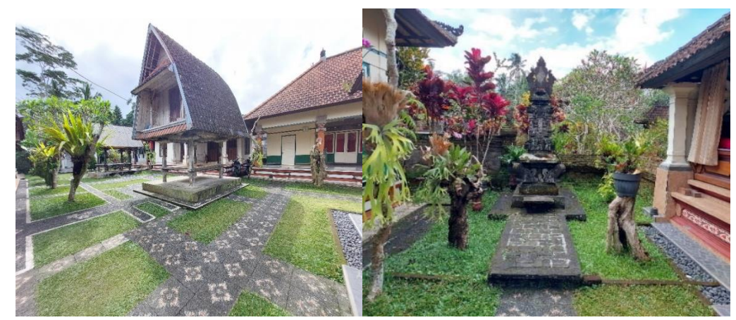
Gambar 8: Pinge Tourism Village Traditional Building

The arrangement of houses for the people of Pinge Tourism Village is based on the main village road. This holy place which is usually called sanggah is located on the side of the main road which is in accordance with the Tri Hita Karana philosophy, namely Parahyangan. Then Bale as the Pawongan area, and Kebun as the Palemahan area which is located in the backyard of residents' houses.