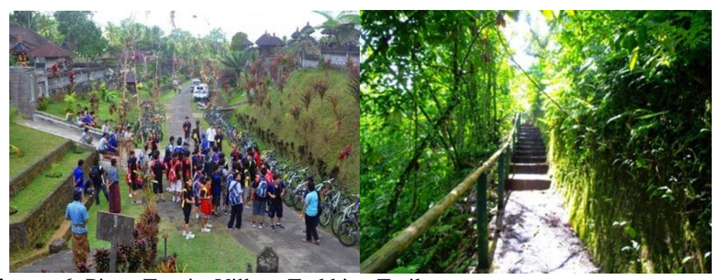
Picture 6: Pinge Tourist Village Trekking Trail

In addition, the artificial potential in Pinge Tourism Village is cooking classes and coffee breaks. Cooking class and coffee break activities can be carried out by tourists at each homestay and managed by the homestay manager and the time for cooking class and coffee break activities is usually at night because most tourists stay only overnight, but it is possible to do it in the morning or afternoon. The menus that are commonly used as cooking class activities are also determined by the homestay manager. The price offered to carry out cooking class activities is included in the homestay rental price.