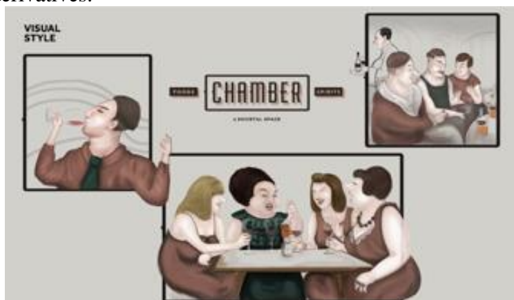
Figure 2. The Societal Space Concept

The first concept was made according to the client's brief (poured into The Societal Space), and the second was a stark contrast with a high-end segmentation (The Paradigm Shift). After The Paradigm Shift was chosen, the brand attributes were arranged so that the design reflects a unified concept. For each concept, Higherpurpose Brand Studio proposed different design derivatives.