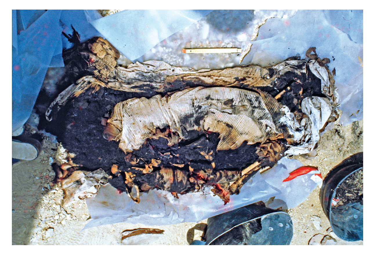
Figure 1. The dress on the body after the mummy wrappings have been partially removed.

were used to close the neckline. Formed of plied yarn, all four are securely knotted at their free ends. The bodice has been attached to the top of the main body of the dress by means of a run and fell seam<sup>8</sup> (arrow in figure 3B). This utilises 2.5 centimetres of extra fabric, and is secured by sixteen whipping stitches per 10 centimetres. Since each yoke or half section misses its sides, there is no indication that the bodice once extended into the anticipated long sleeves.