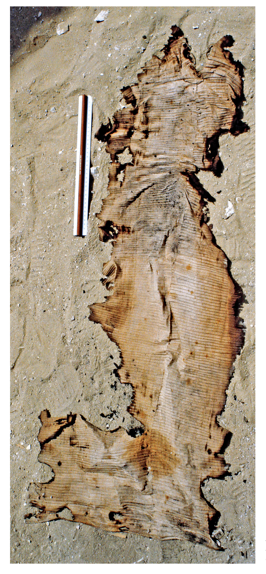
Figure 2. Full view of the dress immediately after removal from the body.