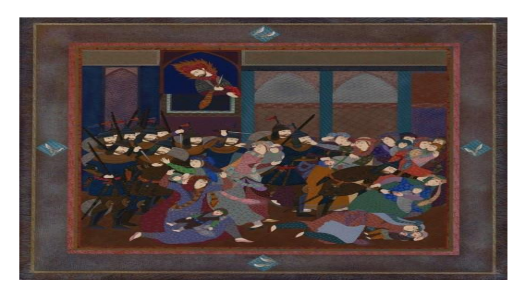
Figure 3 . Fra Angelico and I. (2014). by Farrah Ossouli. From the Listen! Do you hear darkness blowing series. Gouache on cardboard. 75x75 cm