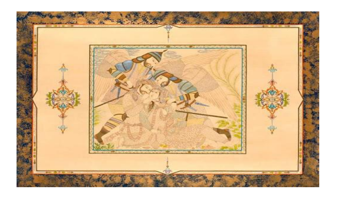
Figure 2. Ahmad and I. (2012). by Farrah Ossouli British Museum. London. Gouache on cardboard. 76x56 cm