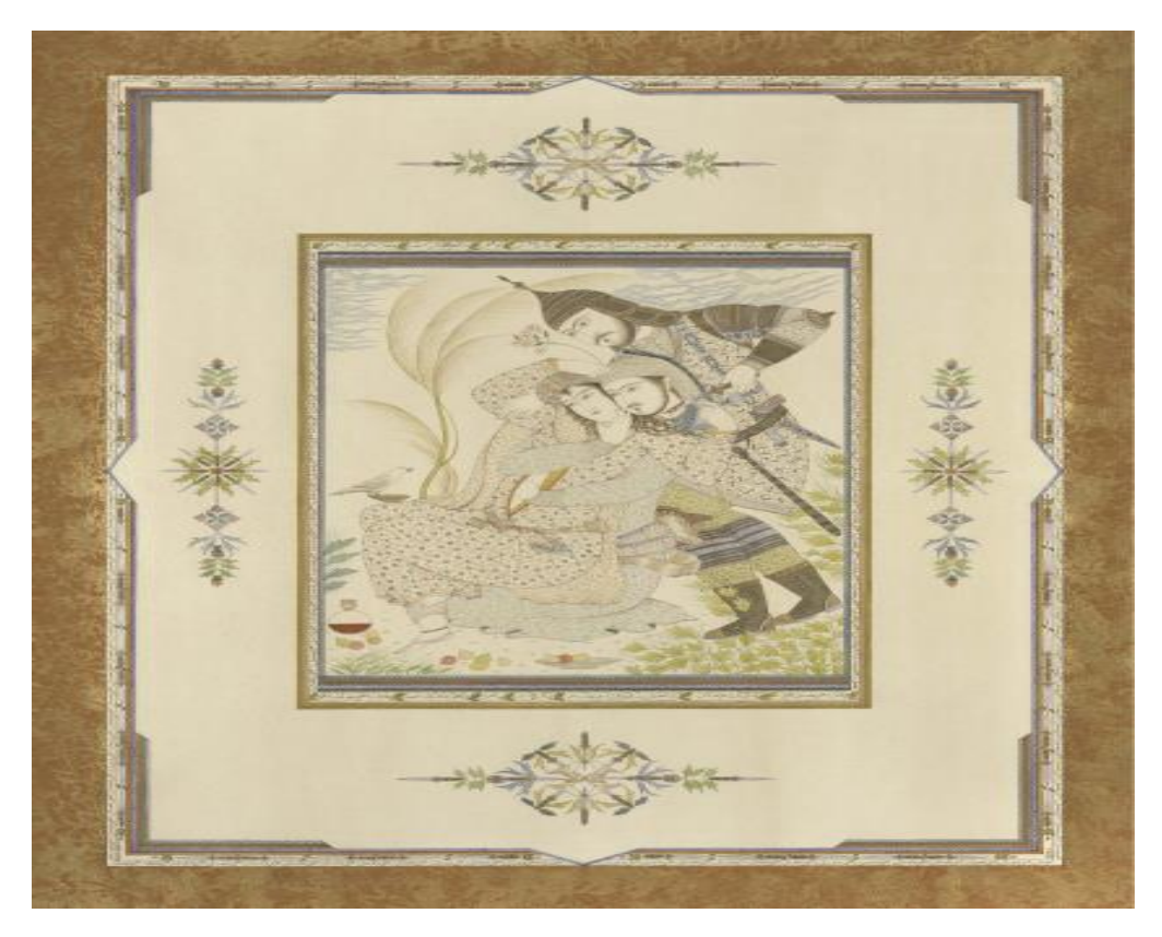
Figure 6 . Reza, Ahmad and I From the Wounded Virtue Series. (2012).by Farrah Ossouli.. British Musem. London. United Kingdom. Gouache on cardboard. 76x56 cm

wearing a dress marked by the infinite and fascist signs (a combination of old soldier and new police) cuts the neck of the lover and kills him. The man in love embraces his love and the last point of his connection to the life is this love and mistress. It means no matter how hard death is difficult for the man, love has been able to connect it to the world and keep them alive. In other words, the woman is like that water for the man before his death. In Reza Abbasi's miniature painting, there is not any birds, but Farah Ossouli by drawing a pigeon has emphasized the poem<sup>7</sup>.