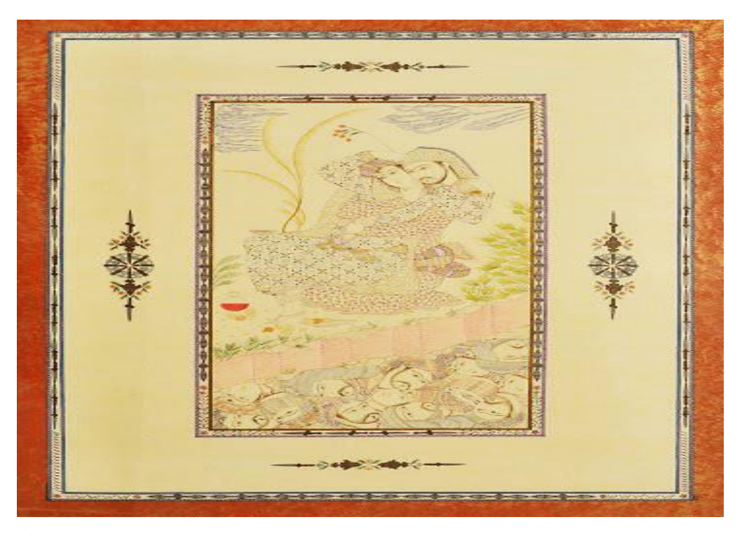
Figure 4. Seven Thousand Years Old from the Khayyam series. (2016). by Farrah Ossouli Gouache on cardboard. 76x55 cm