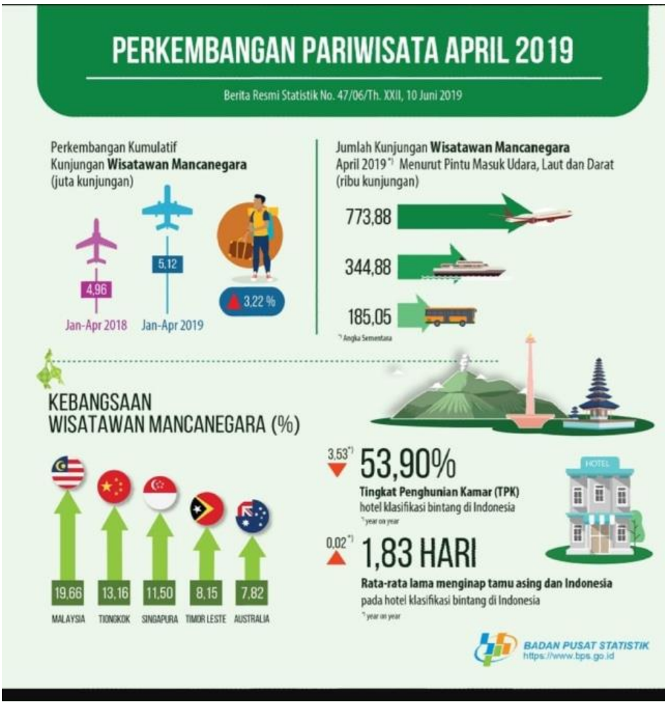
Figure.2 Development of Tourism 2019

This shows that tourism can be the largest foreign exchange earning sector, even now it is the fourth largest national foreign exchange contributor after oil palm (CPO), oil and gas and mining (coal). Foreign exchange donations from the tourism sector increased since 2015 from 12.2 billion US dollars, in 2016 to 13.6 billion US dollars and in 2017 continued to increase to 15 billion US dollars. The tourism sector this year is expected to reap foreign exchange up to 17 billion US dollars, and 2019 projections of 20 billion US dollars.