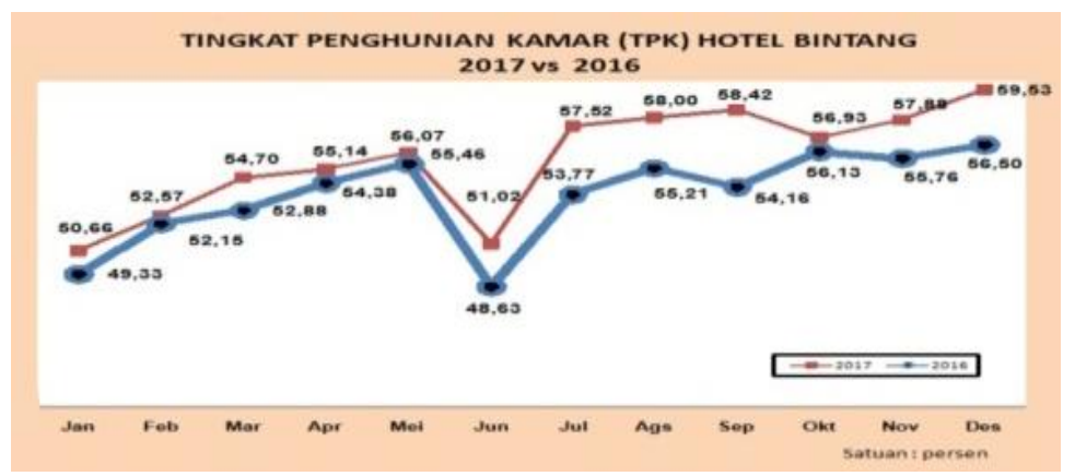
Figure . 3 Occupancy Rate of Star Hotels in Bandung 2018

In developing the tourism industry, hotels are one of the basic means of providing lodging, hotels have a different understanding for everyone. Meanwhile, according to the Big Indonesian Dictionary (KBBI) stated that the hotel is a multi-room building that is rented as a place to stay and eat people who are traveling. (Widjaya, 2015: 33).