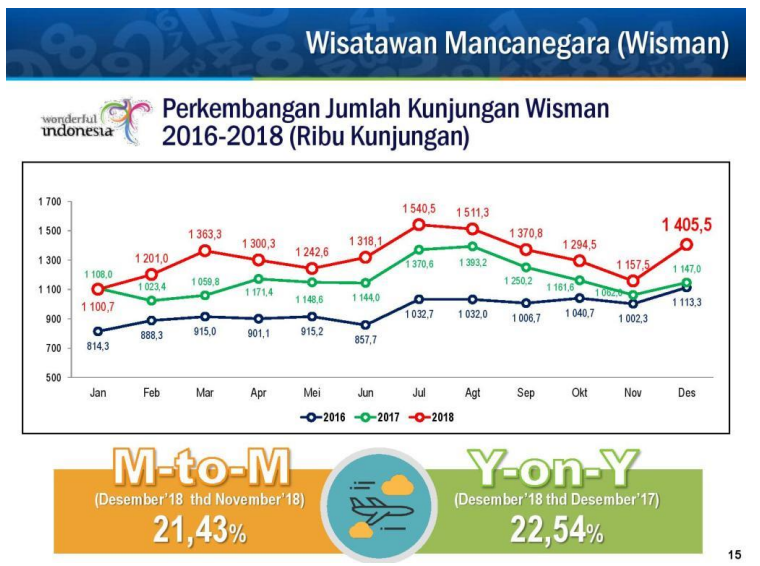
Figure .1 Development of Foreign Tourist Visits 2018

The tourism sector recorded the 9th highest growth in the world, the version of The World Travel & Tourism Council (WTTC). It was announced by WTTC that Indonesia is the ninth highest tourism growth country in the world, "Indonesia's tourism growth in January-December 2017 reached 22 This growth rate is above the average growth of world tourists by 6.4 percent, and the growth of tourists in ASEAN by 7 percent. While Vietnam is growing better at 29 percent, the reason is that Vietnam has done a lot of deregulation. But Indonesia's tourism growth is far higher than Malaysia's which grew only 4 percent, Singapore's 5.8 percent and Thailand's 8.7%