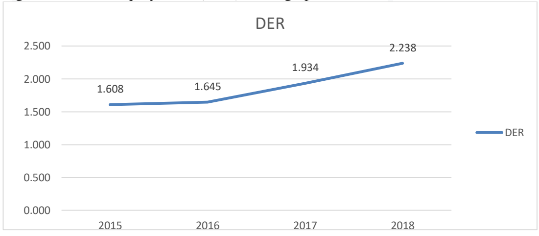
Figure of Debt to Equity Ratio (DER) as the graph as follows: