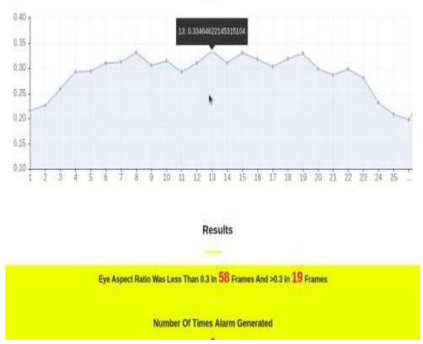
Figure 2: Driver Drowsiness Chart

defsound_alarm(path): playsound.playsound(path)