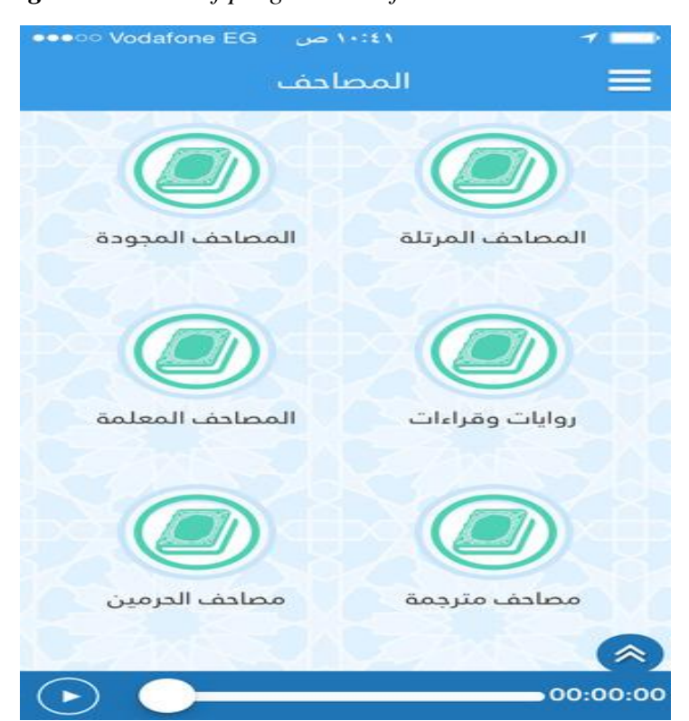
Figure 3: Masahef program interface

The application alerts the user to read and respond daily according to the dates set by the user. Also, it is automatically linked to prayer times or fixed dates throughout the day. It includes the application of Saadi's interpretation and several recitations as well. This App provides a search feature and a bookmarks feature as well. The website can be used directly from the internet. Or, after installing it on the device, it can be used without an internet connection or download the application and a display of some surrats. The website aims at disseminating the recitations of the Holy Quran and its meanings to all people in all their local languages, to enrich the internet field with accurate, free and reliable readings in the different languages of the world. All contents of the website are free and can be republished and distributed.