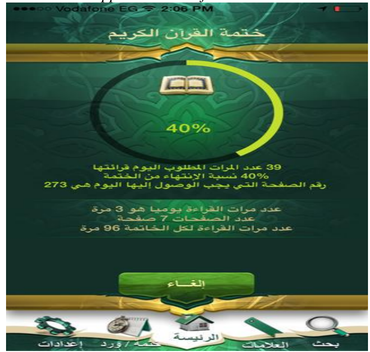
Figure 4: Khitma application interface: