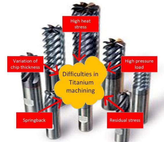
Figure. 2. Difficulties in Titanium Machining.

of research have been conducted in improving the machinability of titanium alloys and yet vast improvement needed to tackle in the difficulties issues in titanium machining. Figure 2 shows the list of difficulties in titanium machining.