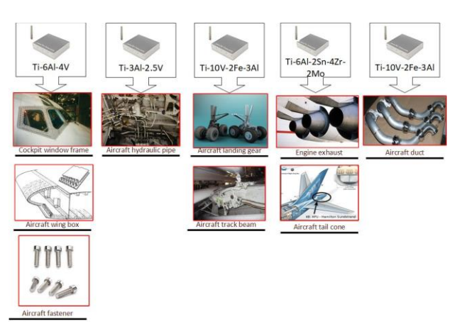
Figure. 1. Example of parts and components made by titanium alloy in aircraft

Titanium alloys are categorized under super alloy and known as hard and difficult to machine materials. There are four grades of commercial pure titanium that categorized by strength that can be used to meet the tasks and workability. As the most notable advantages of titanium alloys is the strength, it is perfectly suit for aircraft demand as the several important parts and components are made of titanium alloys [1]. Figure 1 shows the examples of aircraft parts and components that made by few types of titanium alloys in current aircraft development.