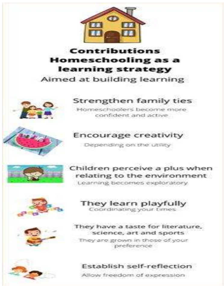
Figure 3. Contributions of homeschooling