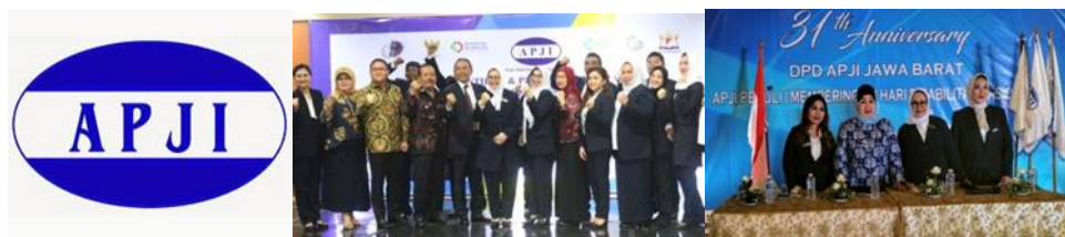
Figure 2 Asosiasi APJI

education and training, Schools, Travel Agencies both land, sea and air including offshore, hotels, hajj, restaurants, state events, weddings, exhibitions, BLK, and various service delivery related to food services including rental of decoration equipment, cars, suppliers of raw materials , and others.