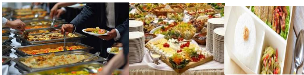
Figure 1 Jasa Catering

One part of the food and beverage industry is the catering industry. Where in it there is a catering service business. The catering service business is currently very much in demand by many people, because of the increasing mobility of life in this city, there are many requests from people who need these services. Because at this time most of them think practically, when holding an event that requires food and beverage services, from there catering services have now become one of the needs of the metropolitan community and because of that the growth of the catering industry is growing rapidly, many entrepreneurs are taking advantage of this opportunity.