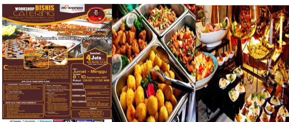
Figure 4 Competitions for Catering Services in Bandung

The population of Indonesia from year to year continues to increase, causing the need of Indonesian people for food to increase as well. The increasing need for food has brought business opportunities that can be captured by the Indonesian people, one of which is the catering business. This business is in great demand by the community because it is considered to have a relatively fast rate of return on capital and can meet community needs. This can be seen from the increasing number of successful and growing catering businesses, both at local, national and international levels, which are currently increasingly competing in the market.