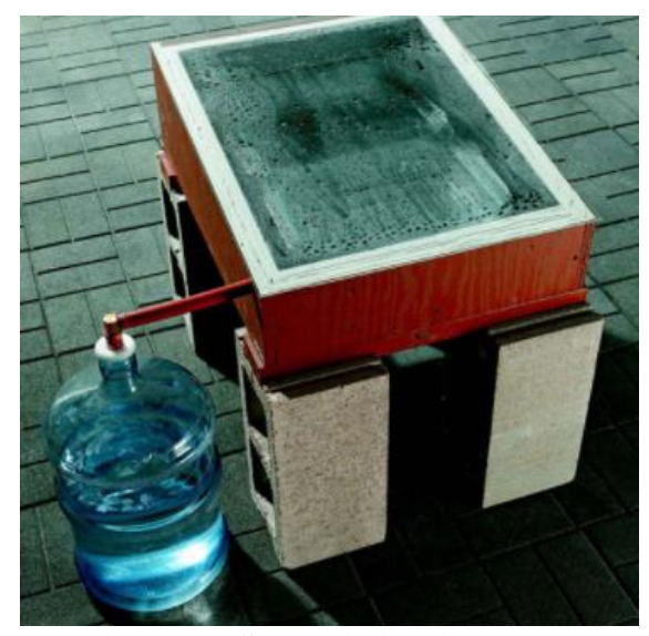
Figure 2: Solar distillation plant

Consolidated water voyages by means of an inner collection box through a slanted glass cap and out through a holding holder.