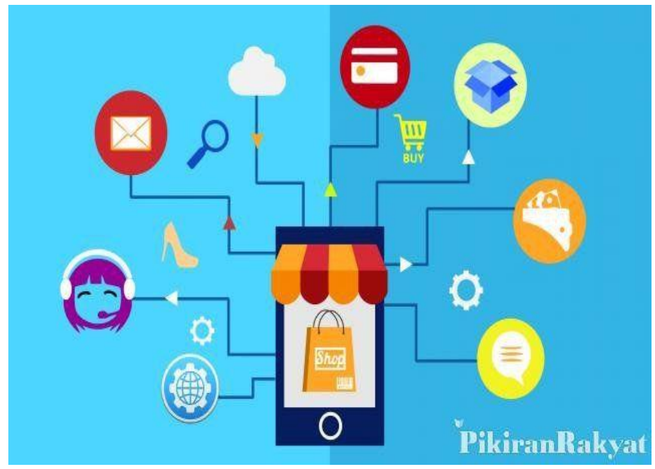
Figure 3. Transactions via e-commerce

But in reality the use of Information Technology in MSMEs is still very low. Research institute AMI Partners revealed the fact that only 20% of SMEs in Indonesia have computers to support their business activities. Constraints on the use of Information Technology in MSME development include: