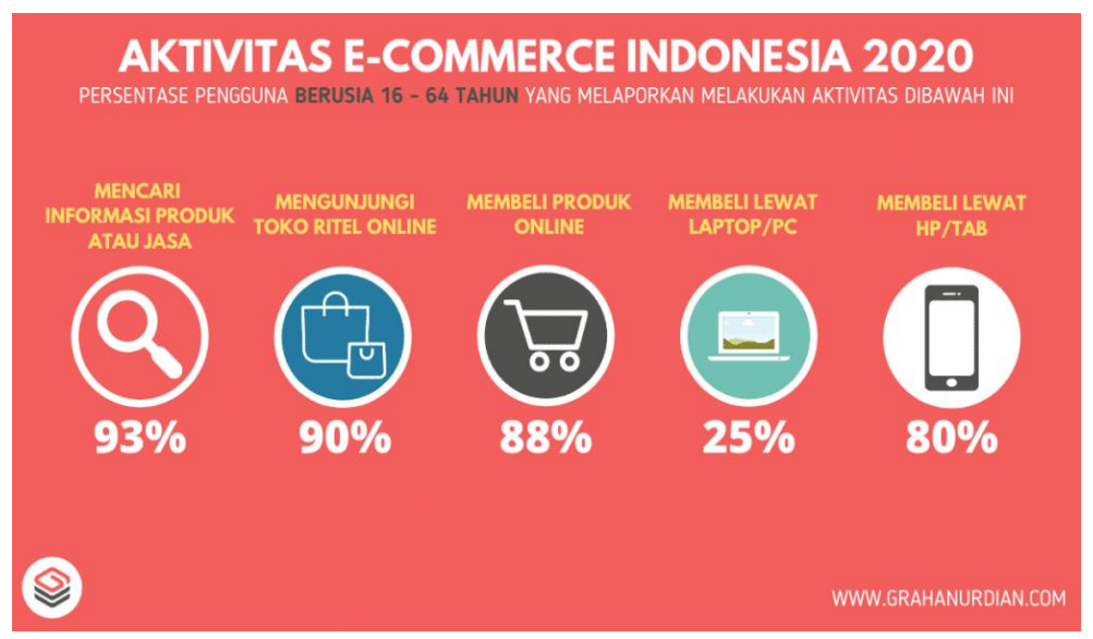
Figure 2. Activity E-Commerce Indonesia 2020

Looking at the picture above, it can be seen that nowadays many people have started to switch from who usually like to shop for household needs by visiting the store, little by little switch to shopping for household needs online. As well as traveling and buying a toy and hobby has become a lifestyle and necessity for people in Indonesia.