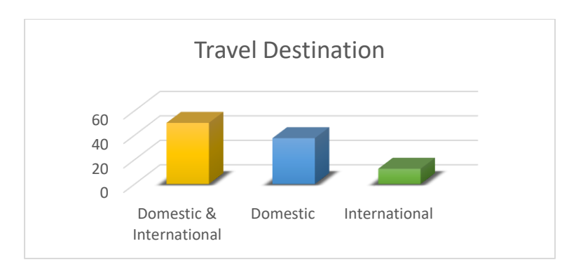
Graph 2: Incentive Destination Choice

The exploratory factor study was carried out to investigate the influences that impact the desire of tourists to visit a destination. Four factors could be identified in the results: sporting events, emotional refreshment and relaxation, visits to historic places and entertainment.