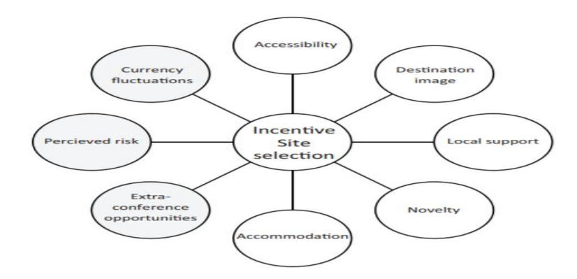
Figure 1. Incentive travel planners' site selection factors

The main variables in this analysis were the usability, affordability and picture of the destination. Conference services and the site environment were deemed to be less critical for reward planners[11]. Other critical factors that have emerged, but not generally known as site selection variables, were destination novelty, perceived risk and exchange rates/currency.