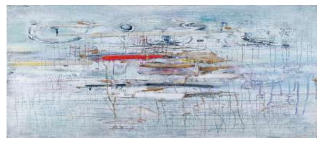
Figure (2): Evacuation Returning by Shaker Hassan Al Said

Hassan Al Said has also been interested in establishing a contemplative approach in plastic art based on the reduction of real-world images and signs that the artist captures from the spontaneous writings on the walls of popular Iraqi alleys and the effects formed on the dilapidated surfaces of time in which he finds patterns of spontaneous spiritual expressions that express the imagination of the Iraqi individual, the popular sense, and the abstract forms that stimulate the imaginations of the meditator with their spiritual, historical and psychological depth, as the artist devoted his artistic life to the production of works of mystical proportions based on a few artistic elements that wander in free spaces and raise in the recipient various ideas and visions that lead to deep thinking and contemplation of the nature Creation, existence and the power of the great creator (10) as in Figure (2).