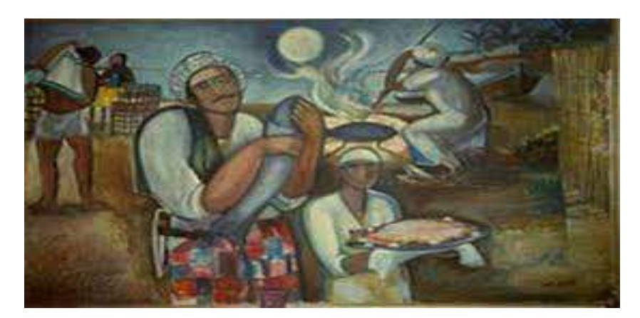
Figure (1): By Nizar Salim

The Iraqi artist Nizar Selim had a simplified expressive tendency that traces the experiences of the creator Jawad Salim with caution, as he did not deviate from the direct employment of the heritage scenes derived from the life of the ordinary Baghdadi individual, as his works show the vocabulary of Iraqi homes, Baghdadi costumes, and his figures are always in confrontation with the recipient and they are They perform actions and movements that are a direct recording of what is happening in the daily practices of sellers, builders, fishermen in the Tigris, bakers, and other scenes that are copied from the usual stereotypical practices of people. The artist reproduces them in a formative behavior that gives them the characteristics of the expressive image through simplification, reductionism and some innovative color treatments (8) as in Figure (1).