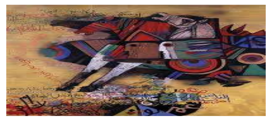
Figure (4): By Dhia Al-Azzawi

While the symbolism of the letter took on a wider dimension with the artist Dia al-Azzawi, who was preoccupied with the presence of the Arabic poetic text, eloquent, pre-Islamic, or contemporary in his artistic works. As Al-Azzawi drew many paintings inspired by the atmosphere of heroism and Arab horsemanship that Arab poets sang, so his works featured color formations and geometric shapes intertwined with images of horses, swords and stylized faces surrounded by passages and verses of poetry, while the artist employed his ability on Arabic calligraphy to decorate small and large lines that transformed His works are into symbolic images that retrieve the aesthetics, values and principles of authentic Arab life in a contemporary aesthetic plastic framework (18), as shown in Figure (4).