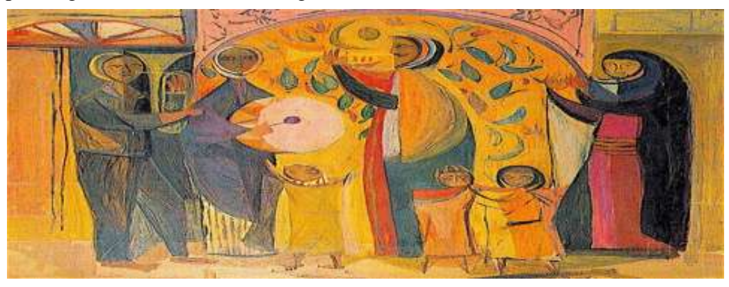
Figure (3): Street Musicians by Jawad Saleem

The symbolic images in the diacritical text are different from what the symbols are in the literary texts, because they take physical visual forms that can be seen visually, which gives them the preference of embodiment before the sight and they are loaded with colors, dimensions, movements, relationships and