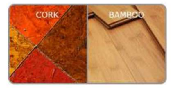
Figure 1.2: An example of cork and bamboo flooring

Roofing materials: As radiant energy from the sun hits the surface of the roof, it becomes heat that radiates down to the Attic. And the rooms next door, Radiant obstacles limit heat accumulation in the upper room by not radiating heat from the roof to the upper floor and finally into the internal rooms. They block the entry into the house of up to 97% of the sun's radiant heat and can reduce attics to 30° on hot days, hold the entire house cooler and reduce air conditioning power usage.