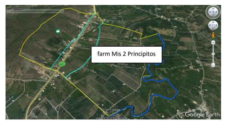
Figure 1. Location of the farm

The farm studied is dedicated to beekeeping and agroculture, it has an apiary made up of 40 bee hives of the species ( apis melífera ), a small meliponiary of melipon bees ( meliponini ), long cycle crops such as coconut palm ( Cocos nucifera ), banana ( musa paradiasiaca ), lemon ( citrus limon ), stick beans ( Cajanus cajan ), fruit trees such as mango ( mangifera indica ), currant ( Phyllanthus acidus ), guava ( Psidium guajava L. ), custard apple (Annona squamosa;L.,), pomegranate ( Punica granatum; L. ), passion fruit ( Passiflora edulis ), a family garden of vegetables and legumes, raising poultry such as chickens, ducks and pigeons, pigs and guinea pigs. In figure 1, its geographical location is observed.