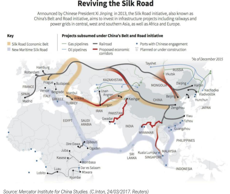
Reviving the Silk Road

As shown in the picture above, Iran has a very important role in connecting East and West, and that is it In addition to the successful communication between the parties in previous years, this will further strengthen the relationship between the parties. In addition to all the content and importance of bilateral relations for each country, the two countries are under great pressure from the United States Therefore, this dispute with the United States has a significant impact on the closeness of the two countries, and both countries have Different capabilities that can complement each other to complement the impact of US sanctions Reduce to a minimum. Iran is constantly restricted by others and, according to Mir Shimmer, a priority The key to any government is survival, so the Islamic Republic tends to include China in the equations of the West Asian region Be able to balance the United States. But the Chinese because they want to communicate with any country Provide their necessary interests, which requires not engaging in political debates, but Iran is trying to use This agreement will bring China into these issues. In the economic sector, too, the parties are under pressure from the United States They work together to reduce this pressure.