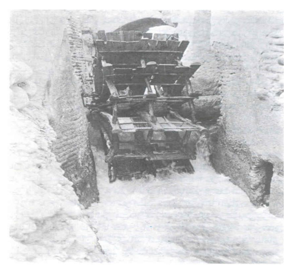
Fig. 4. Image of Rivers Dungeons in the Margine of Karun River Bank (Last days of Gajar period).

It was investigated and the results demonstrated that this type of mill is specific to Dezful (The Iranian Encyclopedia for Young People, 1998, p. 117).