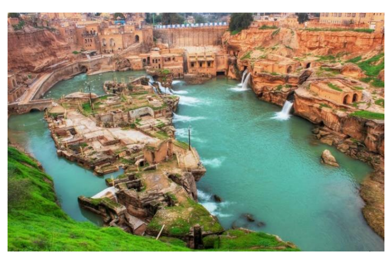
Fig. 1 Perspective of Shushtar Mill Buildings.

Dezful mills are among the first and third types, which are described as follows.