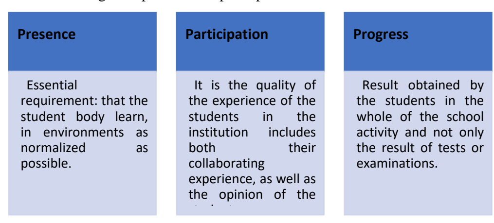
Figure 5. Principles of the Inclusive School.

The inclusive schoolwork's on the application of methods and strategies to organize classes in order to serve different students, the challenge is for all students to develop their different capacities to the maximum with the presence, participation and success of all students. Figure 5 presents the principles of the inclusive school.