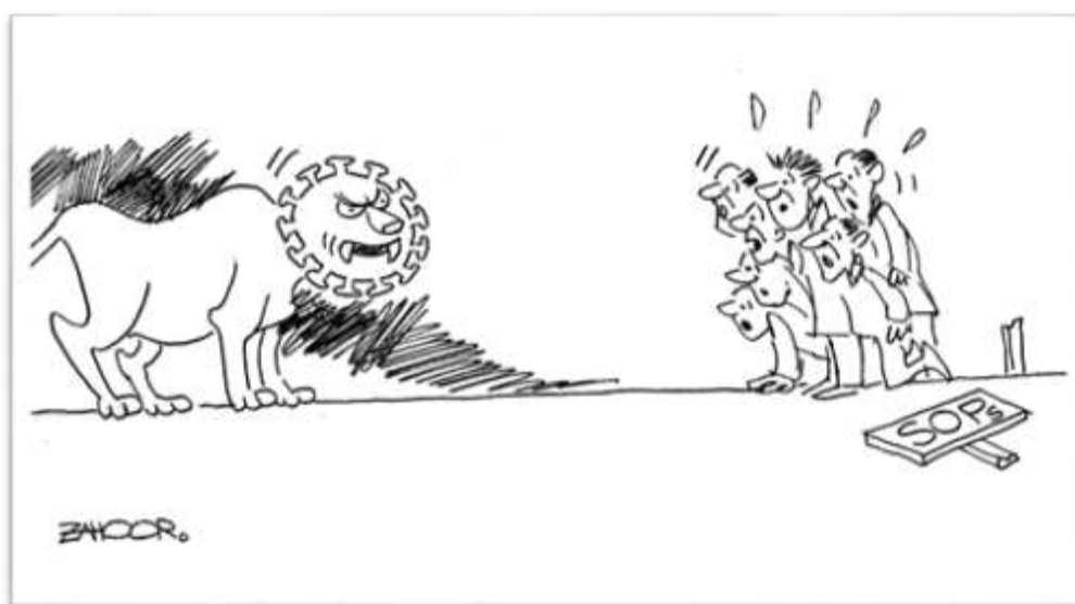
Figure 2 Taken from Daily “DAWN” Dated: 10 November 2020