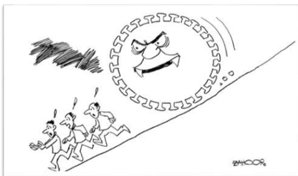
Figure 1 Dated: 5 November 2020

The most common social actors in the cartoons are the political leaders of the different political parties in Pakistan, a symbol of the Corona virus released by the WHO, and the Pakistani society. Their presentations are used to incorporate specific ideas, identities, policies, politics, and certain beliefs. In many speeches, an active role is assigned to COVID-19 and a non-functional role in Pakistani society. In terms of transformation and performance in which participants are involved, it reflects Corona Virus's sign activated concerning visual processes. The COVID-19 mark is always shown as superior and the community is inferior in front of the Corona Virus. The representation reflects the negative stance of PDM political leaders regarding WHO's monitoring of COVID-19. On the other hand, the Pakistani public who participates in PDM public meetings is represented as ineffective and has failed to accept all orders.