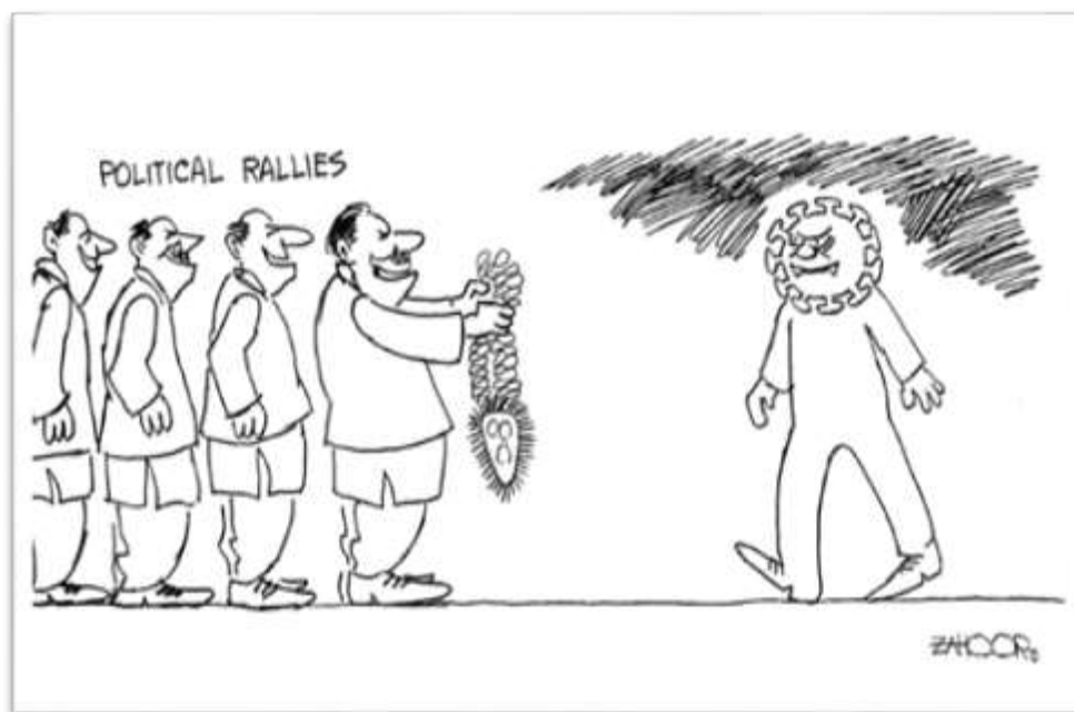
Figure 3 Taken from Daily “Dawn” Dated: 20 November 2020

political cartoons, and its inflicting worry, despair, mental disease, health problems, and economic condition. These editorial cartoons implicitly criticize the official authority's failure to refer an accountable and wise call to facilitate their folks to come back up with this COVID-19 plague.