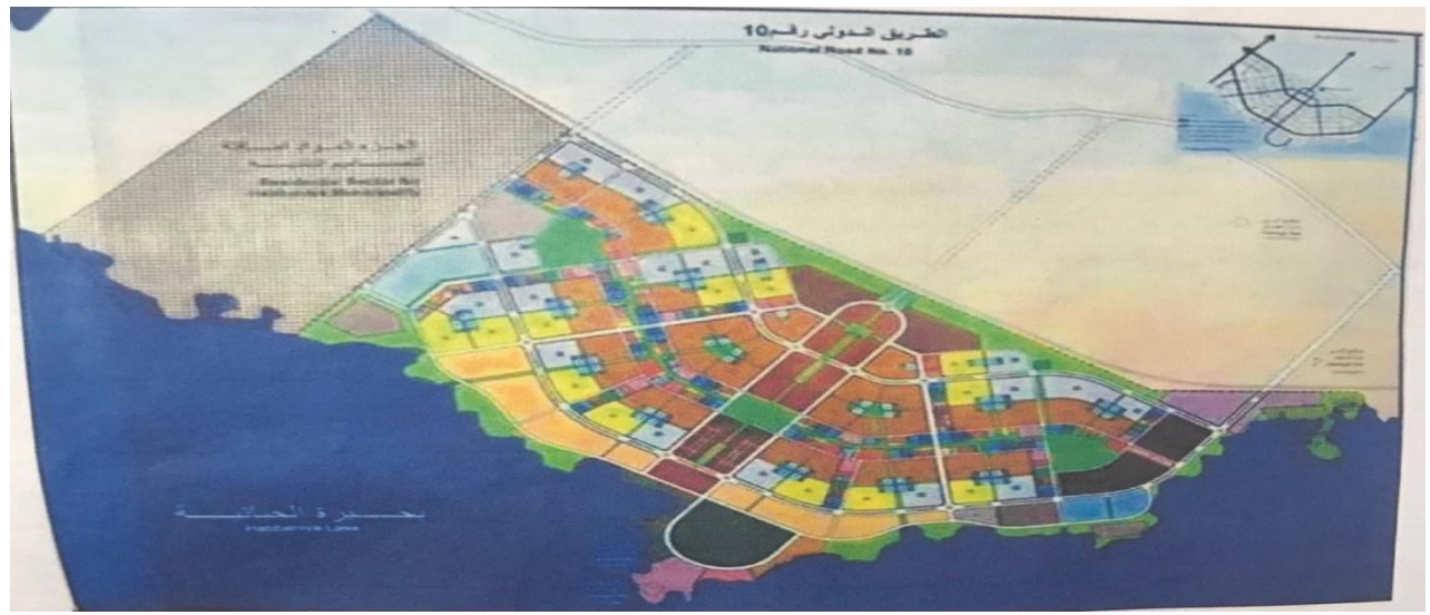
Figure 1: The scheme of the new tourist city in Habbaniyah